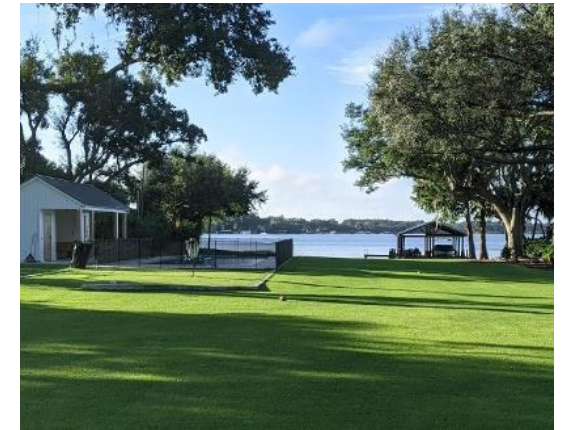
Steward HIS Stuff