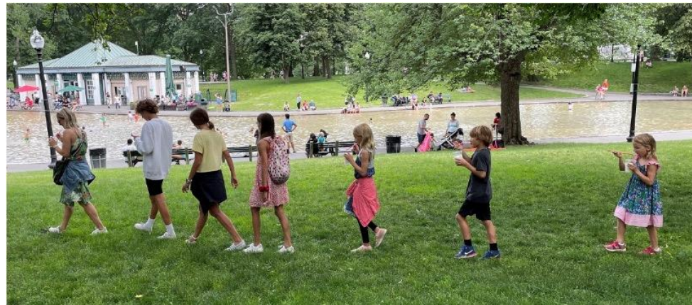
Disciple HIS Kids