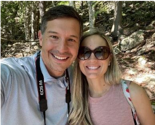
Love One Another